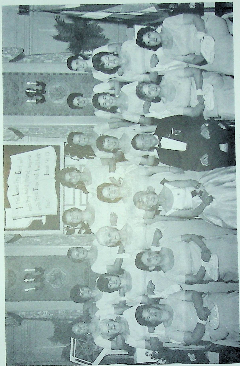
GRAND PAGES 1967 - 1968