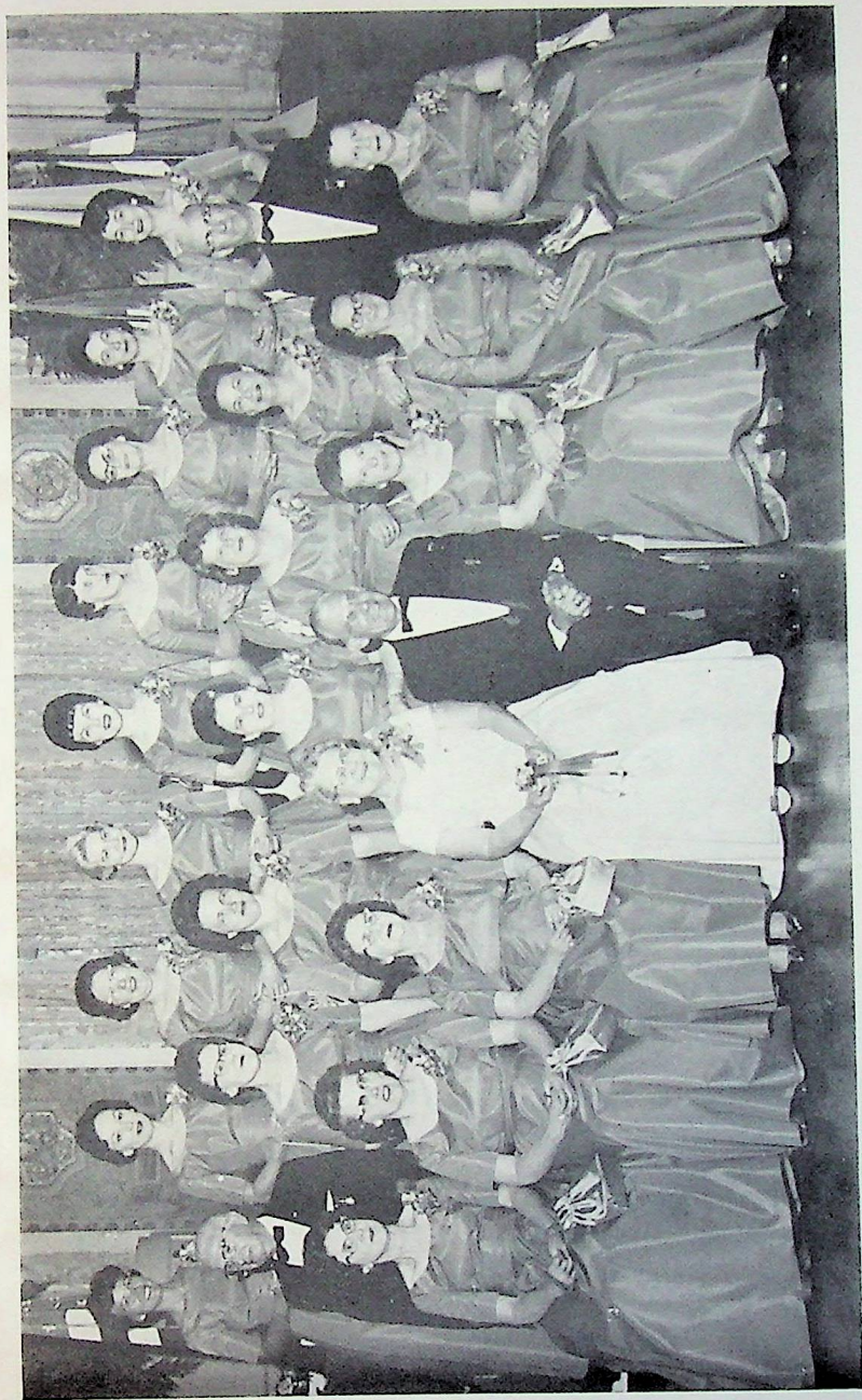
GRAND PAGES 1964 — 1965