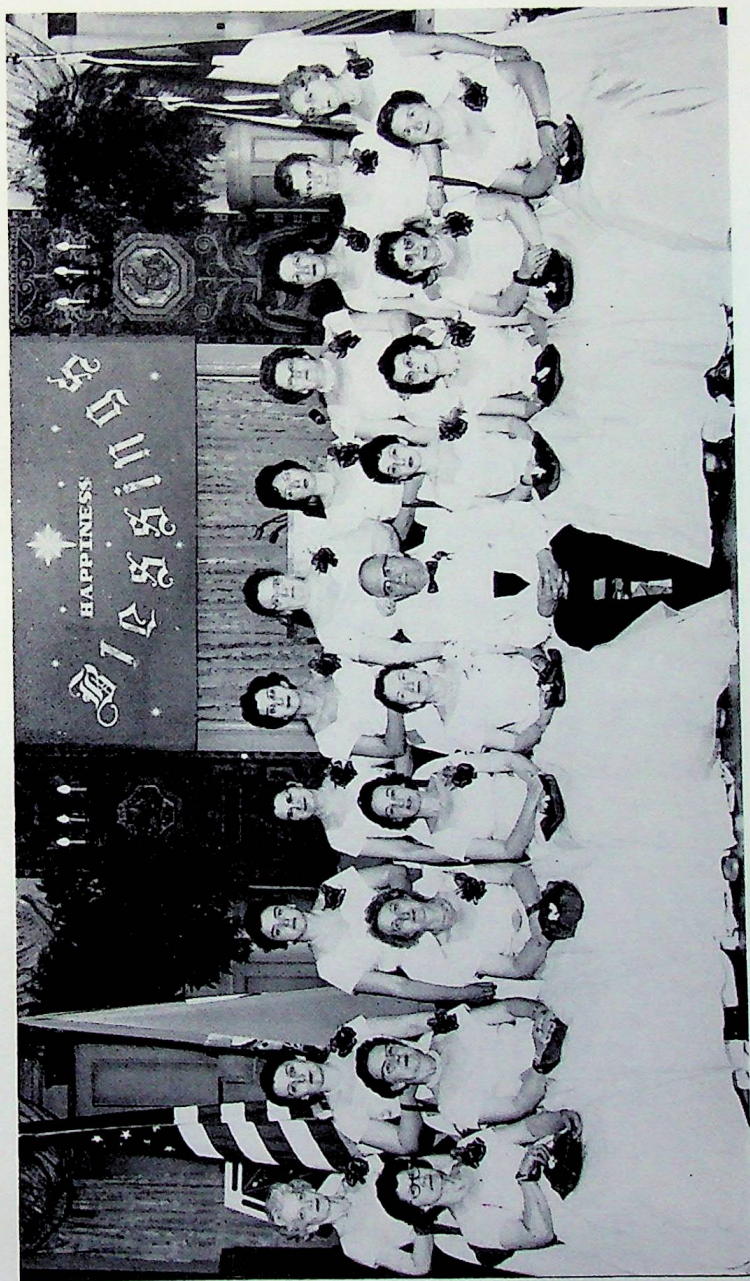
GRAND PAGES, 1960 - 61