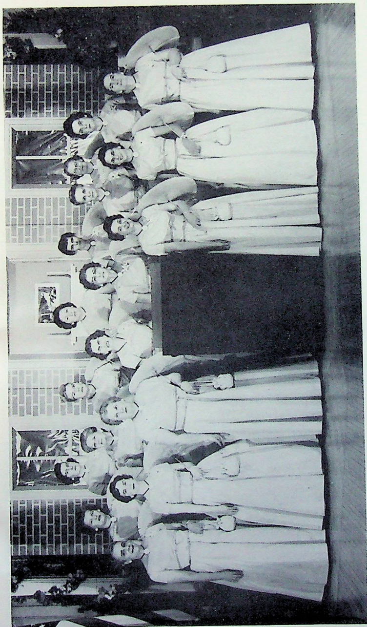
GRAND PAGES 1959 - 1960