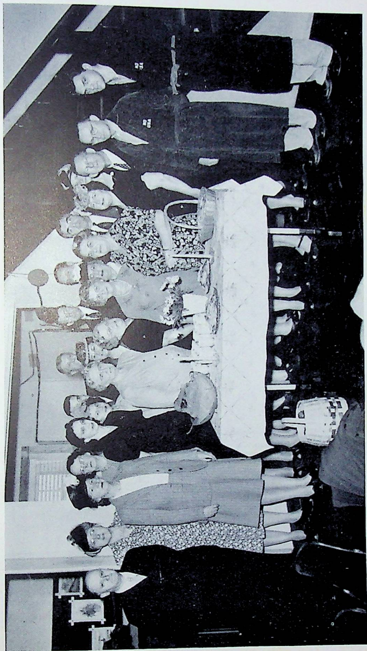
OPEN HOUSE EASTER SUNDAY 1947 AT VETERANS ADMINISTRATION HOSPITAL